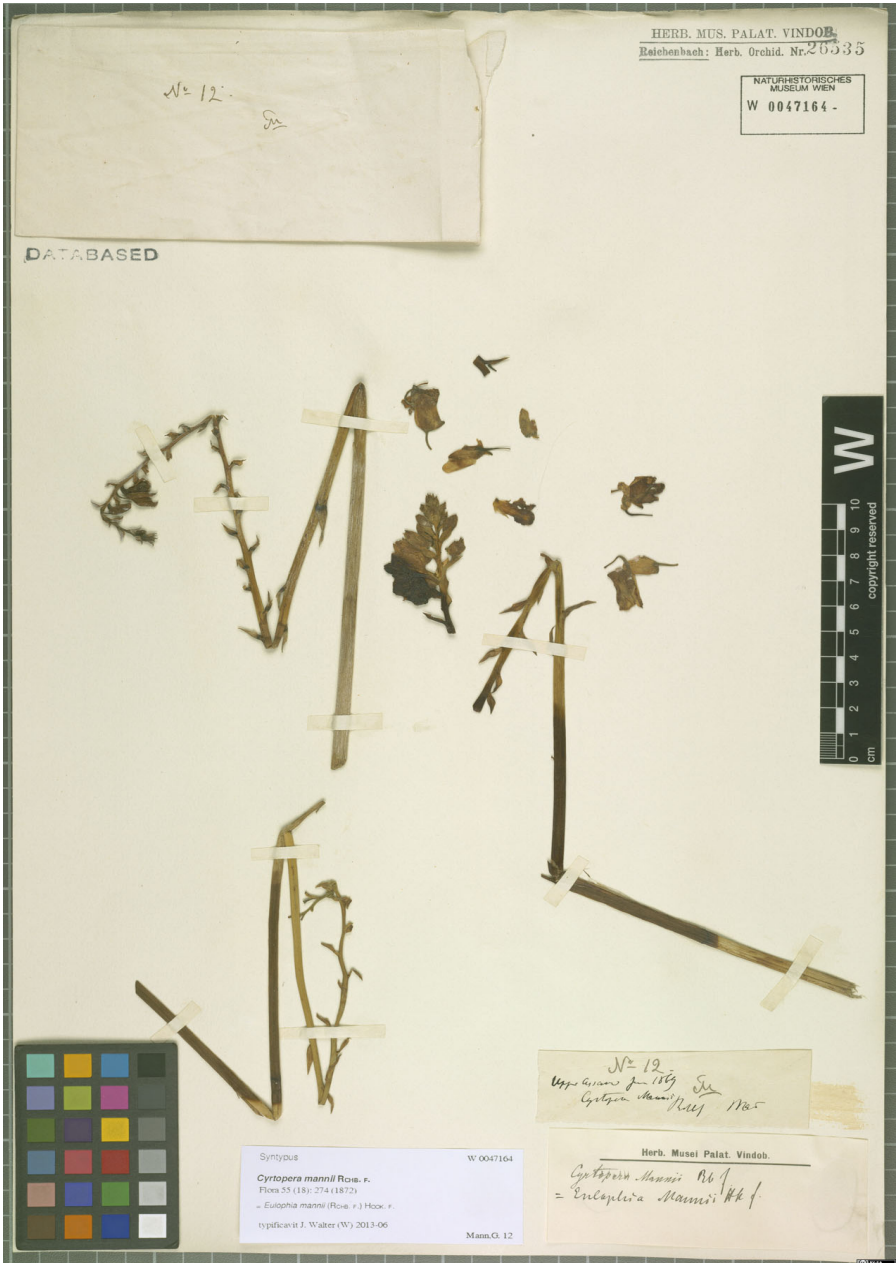
Fig. 2: Selected lectotype of Cyrtopera mannii H.G. Reichenbach